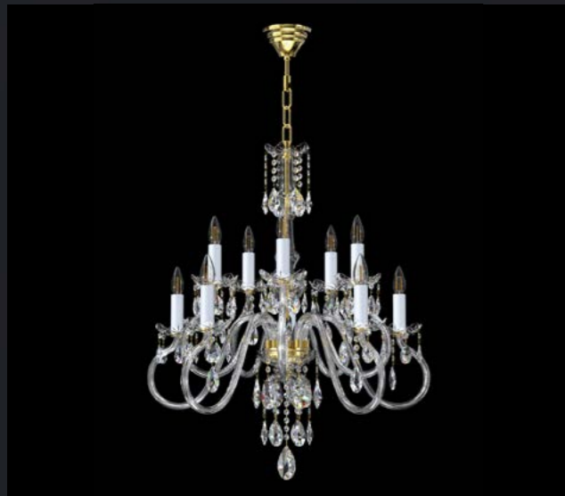
MIRACLE 04-CH-A-PB-CE Ø 750 x H 810 mm | 10 x E14