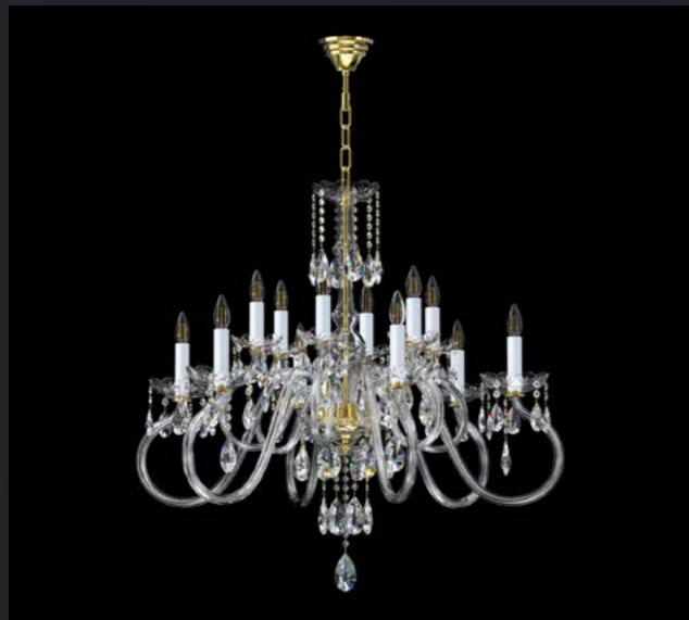
MIRACLE 03-CH-A-PB-CE Ø 950 x H 870 mm | 12 x E14