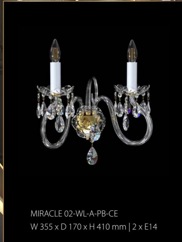
MIRACLE 02-WL-A-PB-CE W 355 x D 170 x H 410 mm | 2 x E14