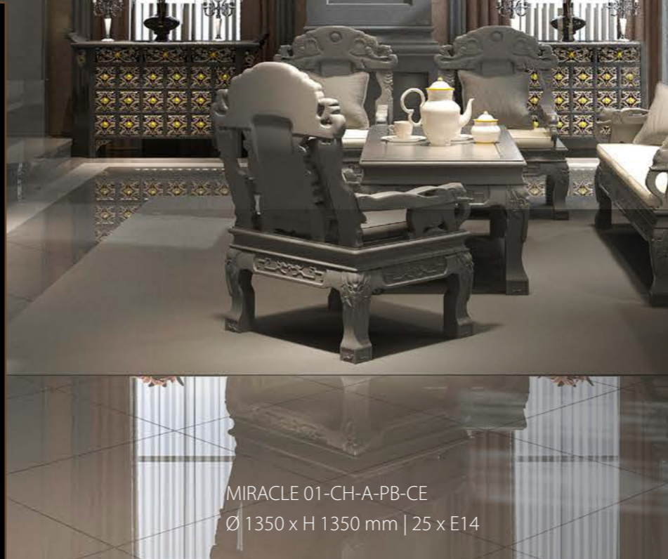
MIRACLE 01-CH-A-PB-CE Ø 1350 x H 1350 mm | 25 x E14