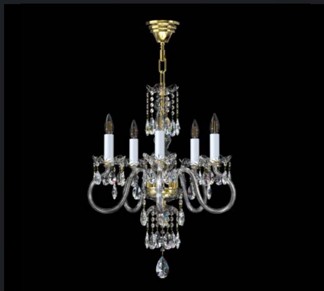
MIRACLE 07-CH-A-PB-CE Ø 520 x H 680 mm | 5 x E14